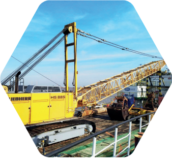
Crawler Crane "LIEBHERR 120 TON"