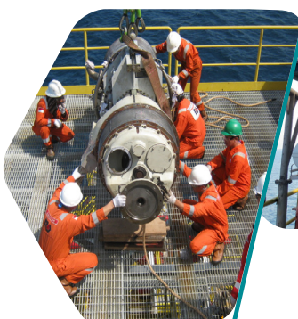
Onsite Overhaul Compressor