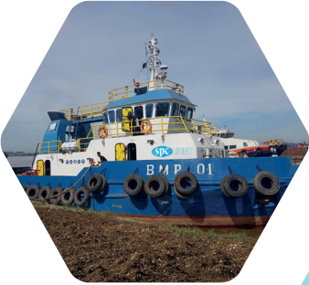
Tug Boat "BMP 01"