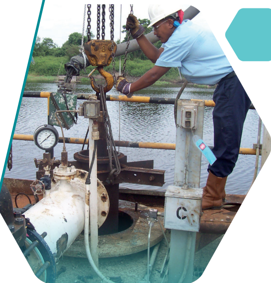
Operation Assistance and Field Maintenance Service – SLO South