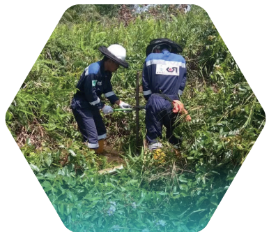
Site Environmental Assessment - HES Due Diligence Rokan Block Area