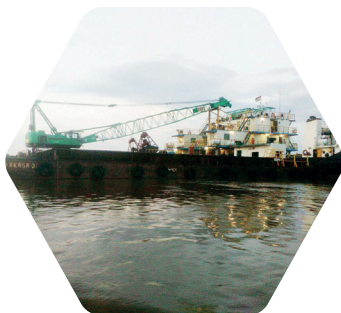
Hopper Barge "PERKASA 01"