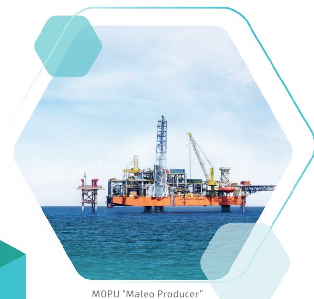
MOPU "Maleo Producer"

Our MOPU "Maleo Producer" platform become the focal point to establish an integrated operation, maintenance and development of Offshore Production & Process Facilities, among others Floating Storage & Offloading (FSO), Fixed Processing Unit (FPU) and Floating Production, Storage & Offloading (FPSO).