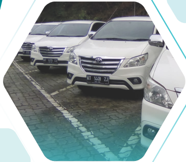
Land Transportation Services for Balikpapan