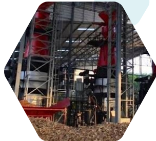
Biomass Power Plant in Nias

As part of development strategies, the Company decided to enter into wider spectrum of energy business specifically in New and Renewable Energy (NRE) industry. Starting with being awarded the Geothermal Concession in Mandailing Natal, North Sumatera through establishment of a joint venture company PT Sorik Marapi Geothermal Power (SMGP) with international well known partners in energy business. The investment in SMGP exposed the Company to an extensive Geothermal Power Plant know-how. Having a vast experience in development along with operation in Geothermal sector, the Company continuously explores other challenging opportunities in NRE industry such as Solar Photovoltaic, Biomass, Waste to Energy Plant moreover performing as the Independent Power Producer.