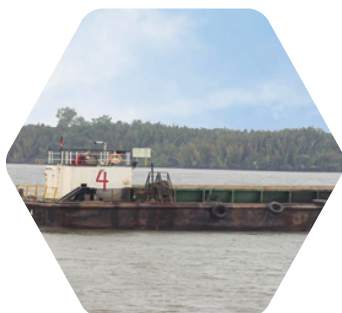
Hopper Barge "ORCHID 4"