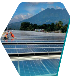
EPC Solar PV Project in Ciherang

Aiming to provide the comprehensive green energy solution services, the Company integrates its valuable and comprehensive experiences in Construction, Technical Support Services, Inspection, Agency and Trading supported with skillful engineers as well as innovative technology manufacturers to grab rising demand for the sustainable green energy needs and achieve ultimate clients' satisfaction.