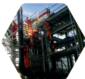
Supporting Booster Compressor Installation, Madura Strait