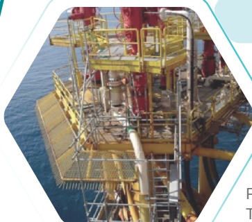
Peluang Field Tie in