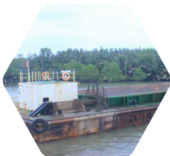
Hopper Barge "ORCHID 1"