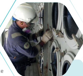
O&M Service in Duri