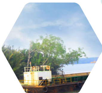
Hopper Barge "ORCHID 2"