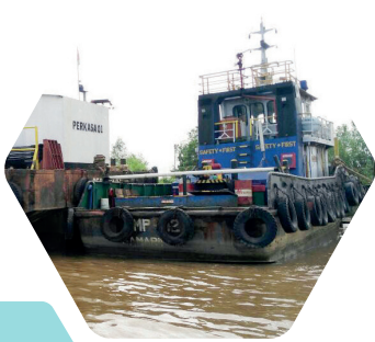
Tug Boat "BMP 02"