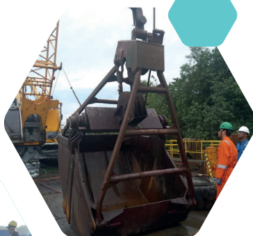
Crane Barge Ex-Package No. 9, East Kalimantan