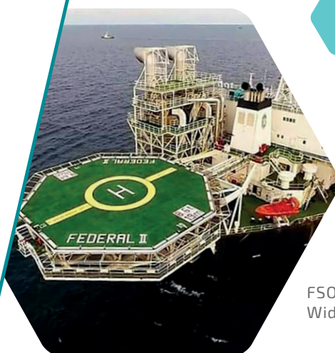
FSO for Widuri Field