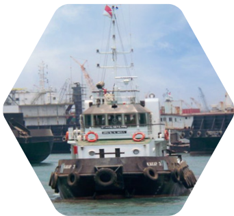
Tug Boat "KAKAP 3"