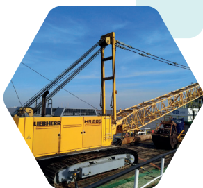
Crane Barge for Dredging & Lifting, East Kalimantan

In Marine Services, we are focusing in Vessel Charter and Dredging Operation for shallow water and coastal sea. For Vessel Charter, we provide spot charter and short to medium term time charter Fleet for offshore and shallow water construction, operation, and maintenance projects and other supporting services such as skilled crews and specialist. Our Dredging Operation activities include riverbank protection, land reclamation and maintenance.