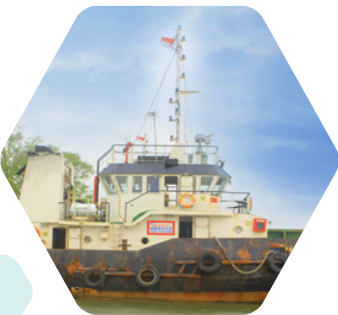
Tug Boat "KAKAP 2"