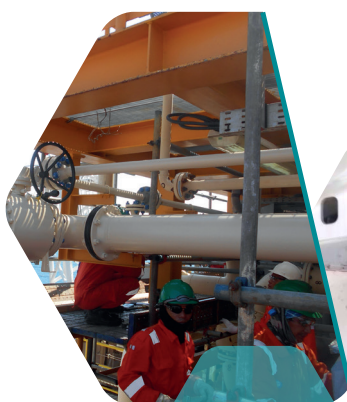
Conversion Works of MOPU