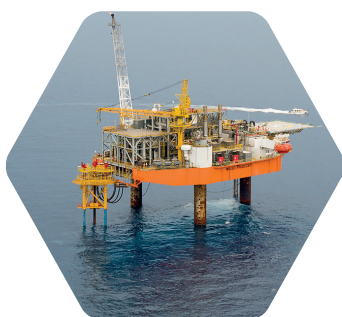
Mobile Offshore Production Unit (MOPU) "MALEO PRODUCER"