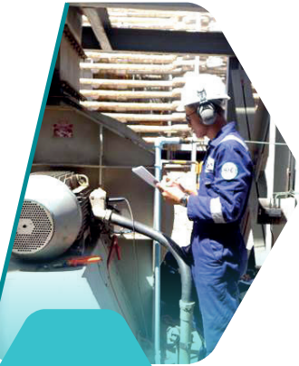
Field Operations Support Services for North Duri Cogen

Starting as a manpower supply service which eventually evolved into O&G supporting services as well as facilities and in order to align its customer needs, the Company established Technical Support Services to oversee O&G Production Facility Repair and Maintenance, Warehouse Management, Operation & Maintenance Service, Labour Supply for O&G, National & Expatriate Specialists, Management Transportation Service and Competency Based Training.