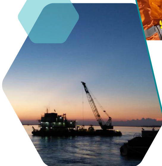
SPL Pioneer Sail Away to Site