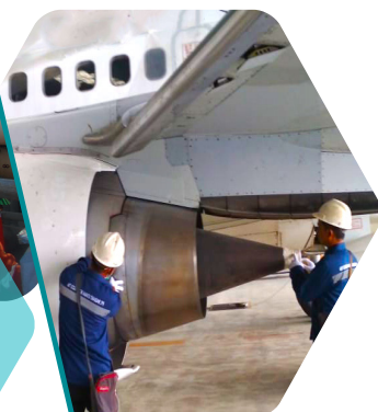
Inspection Service for Aircraft