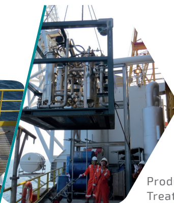
Produced Water Treatment Installation