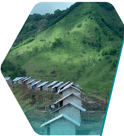
Supply and Installation Solar PV Home System in NTT