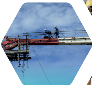
Crane Frog Maintenance Service

We offer international brands for crane and lifting equipment and provide a wide variety of services including sales of new and used cranes, installation, rental, repair, maintenance, inspection, certification, skilled operators and training, spare parts and ancillary equipment for offshore, onshore, marine and port covering the following services: