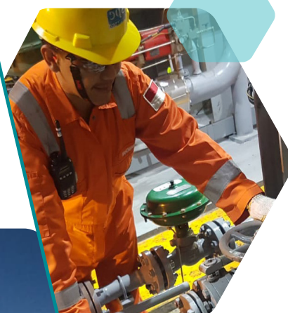
Warehouse Construction Project for Power Plant in East Java