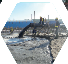
Jetty Dredging Service, East Java