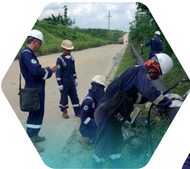
Static Equipment Inspection Services in Sumatera Operations

As a pioneer business activity in Radiant Group, we have been recognized as a reputable Inspection Services Company which offers a complete range of services to our clients by providing experienced personnel and reliable equipment to achieve standard quality expected.