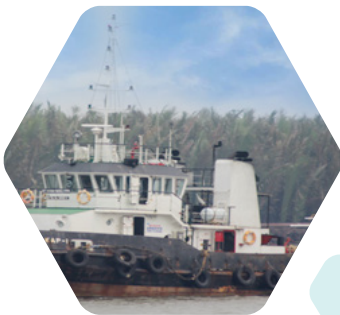
Tug Boat "KAKAP 1"