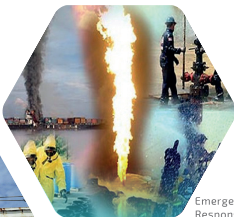
Emergency Response Service