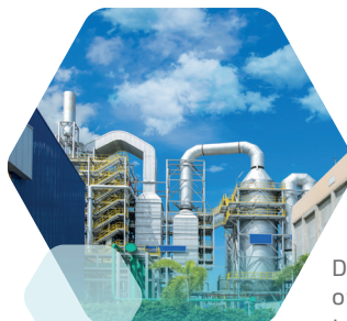
Development of Waste to Energy Power Plant