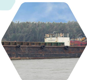
Hopper Barge "ORCHID 3"