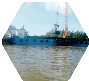
Hopper Barge "PERKASA 02"