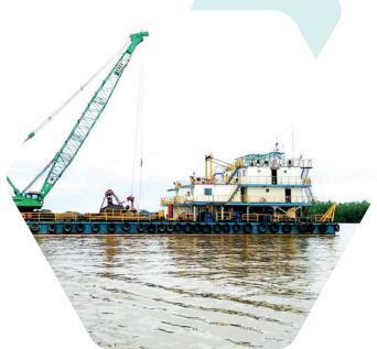
Crane Barge "SAMUDERA PERKASA 01"