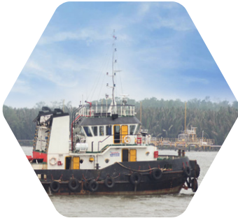
Tug Boat "KAKAP 4"