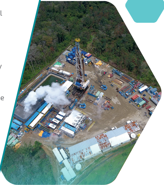
Sorik Marapi Geothermal Power Plant 240 MW

The NRE portfolio of the Company consist of numerous EPC, operation, maintenance including after sales support services of Solar Photovoltaic deliverable to government, educational institutions and industrial clients among others University of Indonesia, Universitas Negeri Semarang, Sanwa Comsys Engineering and Danone. Our recent development is Waste to Energy Power Plant project located in Central Java in collaboration with overseas state owned enterprise and an initiative project of Biomass Plant from agricultural waste in Nias.