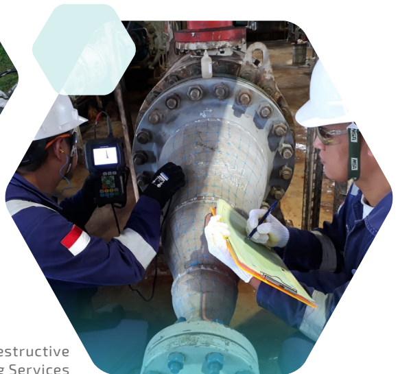
Non Destructive Testing Services