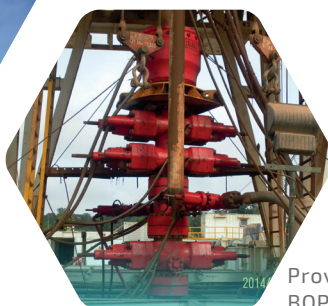
Provision BOP Rental