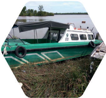
Sea Truck "RIVER 09"